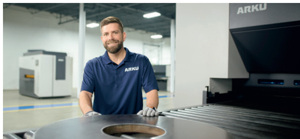
The new location features state-of-the-art leveling and deburring capabilities.

Curious what the new site looks like on the inside? The facility’s style echoes that of a decidedly industrial look, with the exposed ceilings and open office concept popular in modern US office