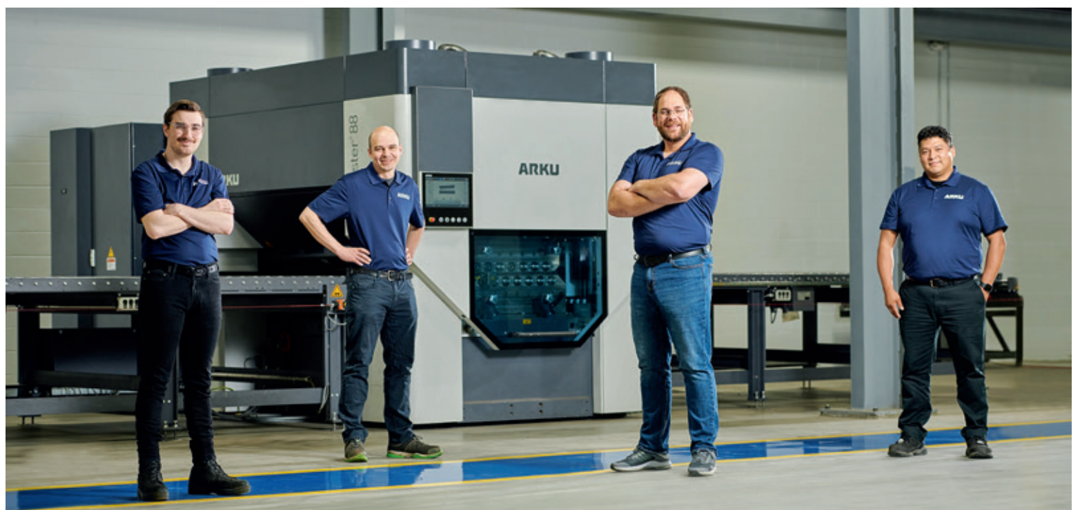
In good hands: At ARKU, customers always receive prompt and professional service from expertly trained service technicians.

Leveling, deburring and coil processing – for quality sheet metal processing machinery, look no further than ARKU. There is something you might not know about ARKU. The company offers you a whole lot more than just machines. Whether before the purchase or during operations, new questions always arise. No matter what the concern is, our service team is readily available around the clock. ARKU services include planning and installation, as well as ongoing support and training. You can even select a tailored maintenance plan for your machine(s). Based on expertly defined checklists, service technicians regularly maintain your equipment. Take a look on the ARKU service page www.arku.com/us/service - or simply call us right away - (513) 985-0500. We look forward to hearing from you!