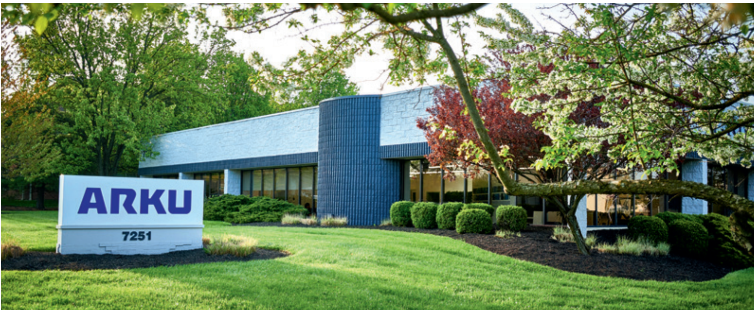
New look: the Cincinnati office is conveniently located off the highway.

The Leveling & Deburring Center also offers complimentary trials and automated flatness testing. In terms of logistics, the team is all set: multiple cranes and vacuum lift tables improve the handling of toll processing