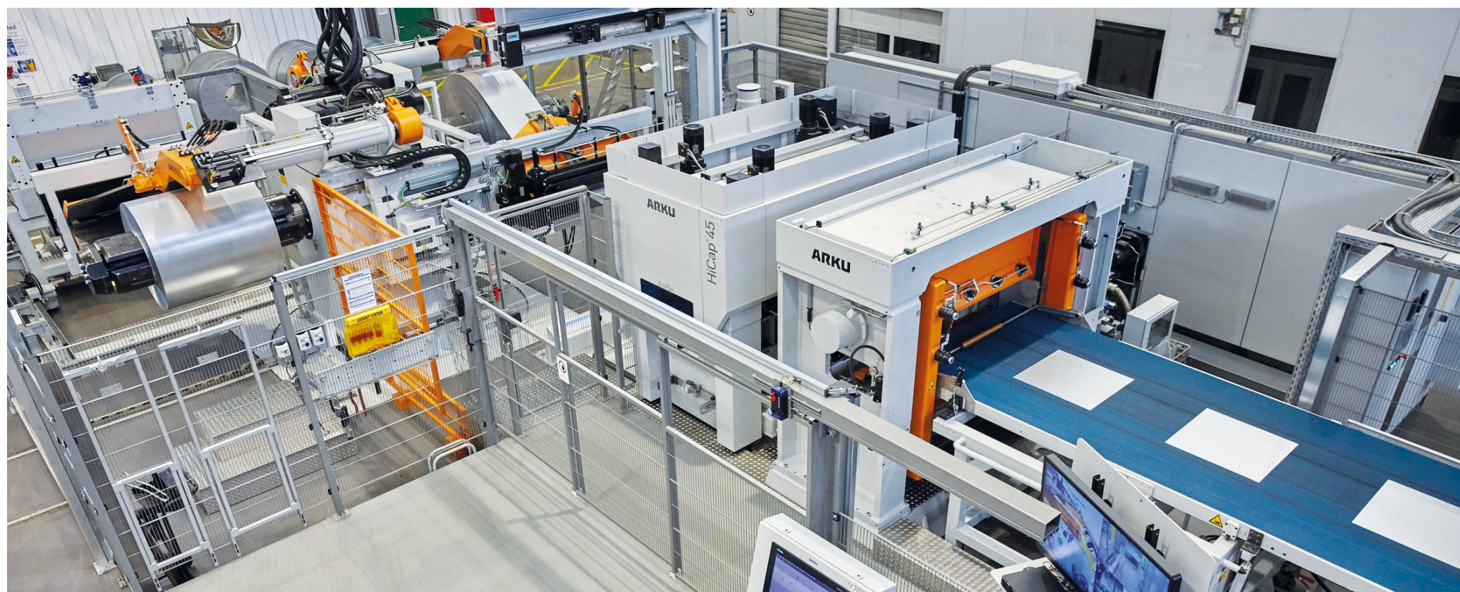
An ARKU feeding line user in the HVAC technology sector needed a cut-to-length line. This space-saving and error-free system makes an effective contribution to producing a diverse range of sheet metal blanks.

All of the ARKU systems around the globe share one thing in common: A 24-hour hotline and service support from Germany, China and the USA.