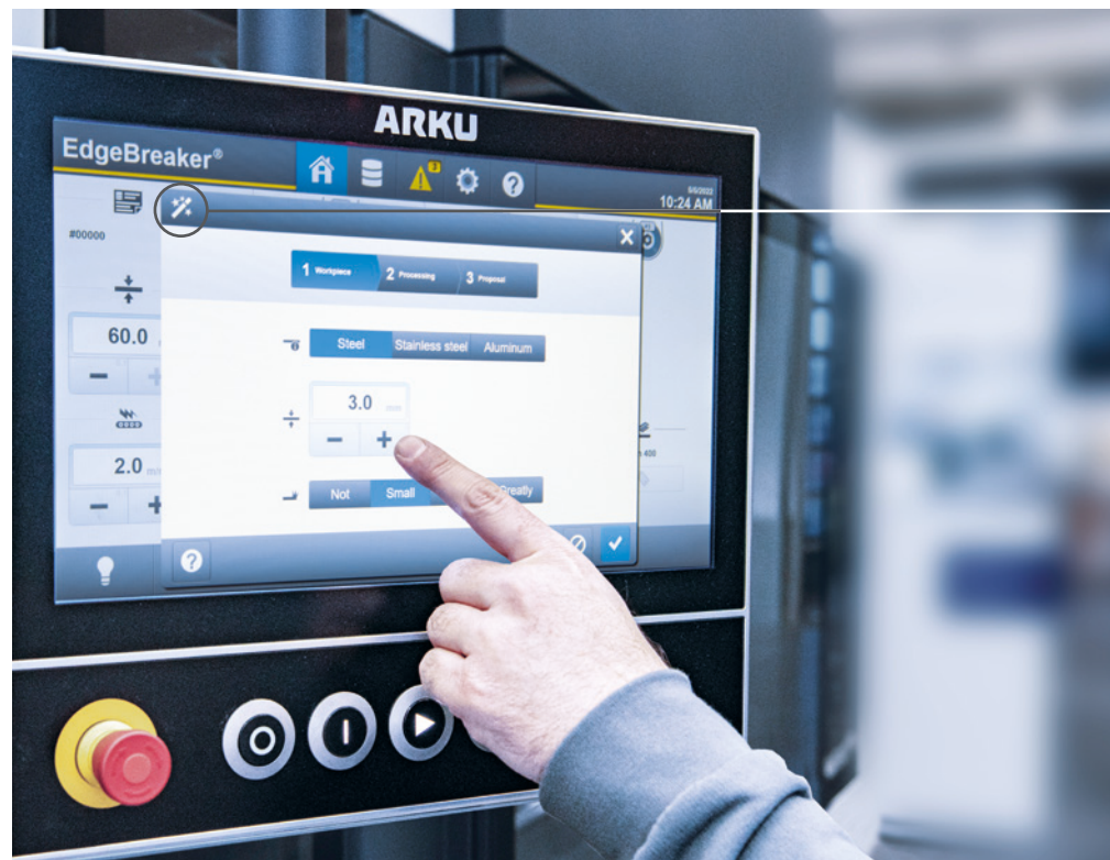
The ARKU Wizard software is now available and helps to achieve optimal deburring results by automatically configuring the deburring machines for the specific processing job.

Users no longer have to experiment until they find the correct settings when deburring parts. Therefore, the software also makes it easier for new operators to quickly familiarize themselves with the machine.