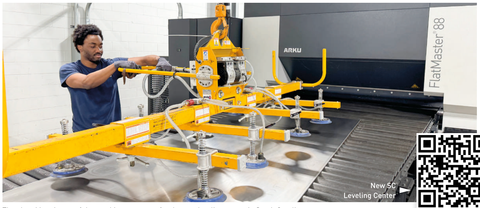
Theodore Mays is one of the machine operators for the new leveling center in South Carolina.

The facility boasts a comprehensive office space and an expansive production area with easy access for trucks. Visitors can take advantage of complimentary trial runs and seeing our machines live in action. Accessibility is a breeze, both in terms of trucks coming in from I-85, and with regard to the facility's dock and side loading/unloading capabilities.