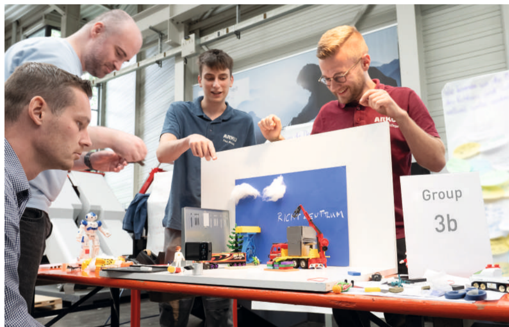
In creative workshops, ARKU employees develop visions for the future of 2030 - with exciting scenarios on climate change, the shortage of skilled workers, technological progress and the role of AI in sheet metal processing.

At the end of the workshops, all employees from ARKU Inc., ARKU in Germany and in China looked at the possible outcomes of the future, discussed them and even immortalized them in videos. All participants were fully engaged and the results were impressive. We will