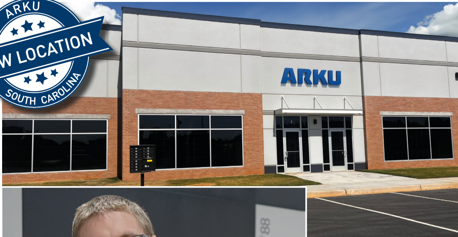
Main entrance of the new facility in Greer, SC.